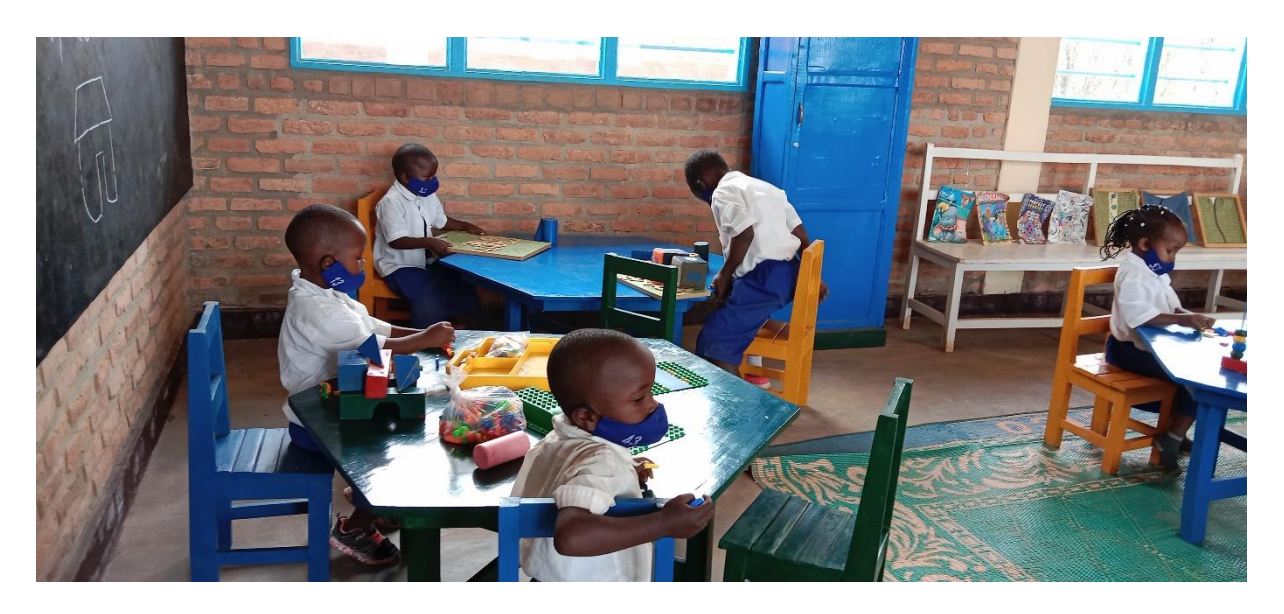
Baby Class in Kindergarten