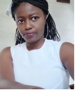
Kids, parents, teachers and I are very happy to be your partner school.