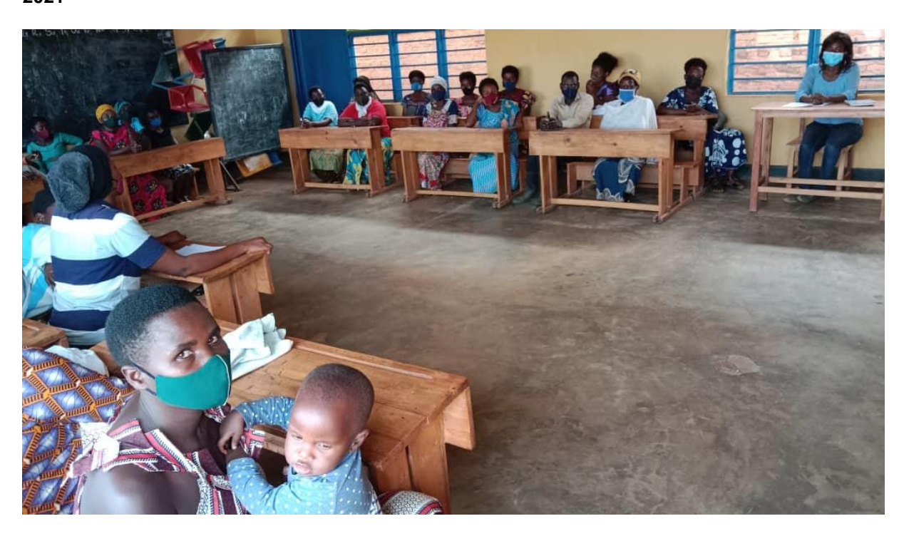
Meeting with the parents