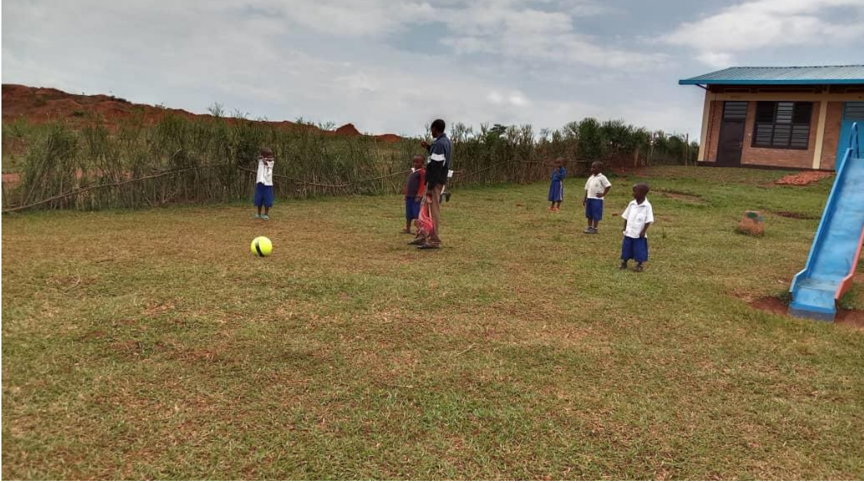
Grade 2 in preparation of playing football