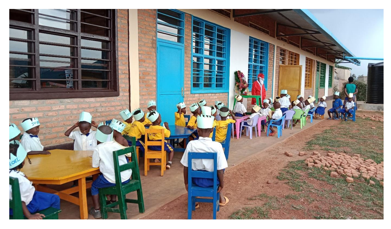
Celebrating the Feast of Saint Nicolas in the preparation of the Christmas Party at school on 2021