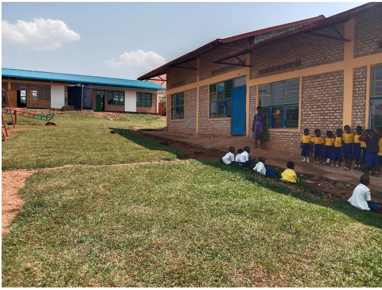
Kids planted flowers during the rainy season