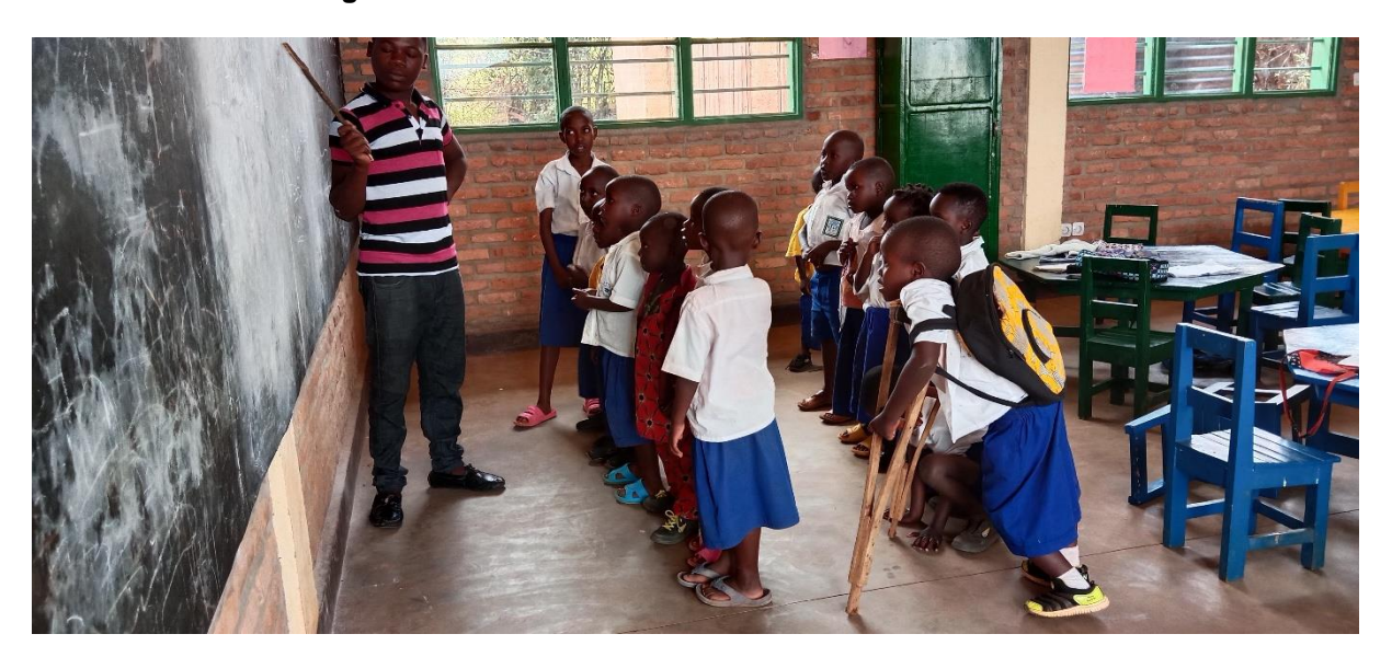
Grade 1 in primary