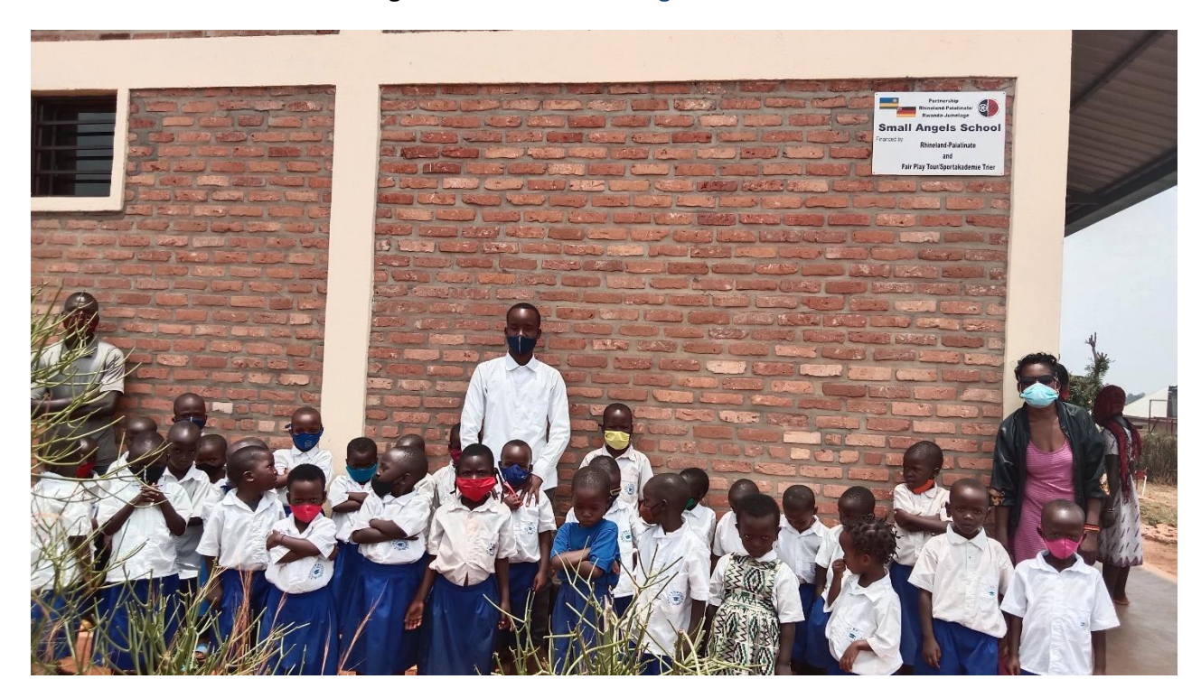
Some Photos of The Small Angels School " Kleine Engel die Schule"