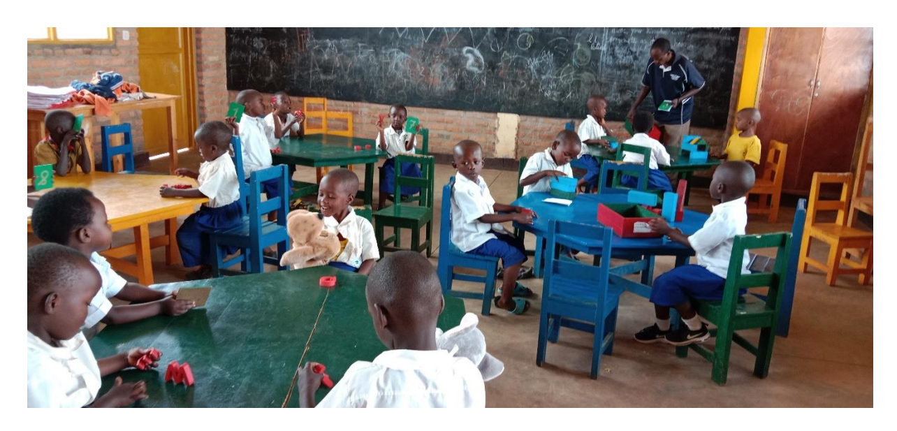
Middle class in Kindergarten